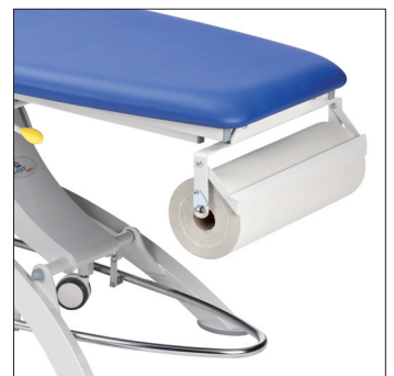
Paper roll holder