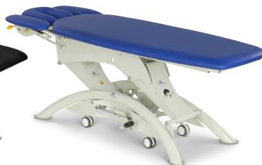
Capre M4H Ocean, hydraulic height adjustment