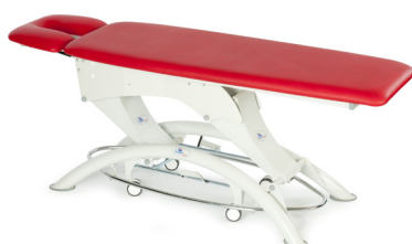
Capre M2 Chili, oval shaped frame tubing, place-free, castor set