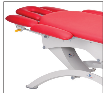
Side supports with fast locking