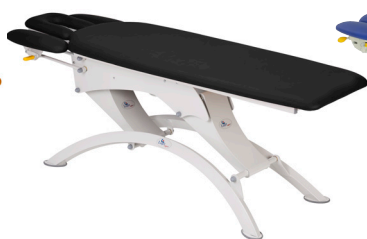
Capre M4 Schwarz, rectangular frame tubing