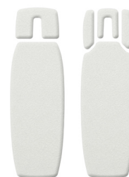
Upholstery options M2, M4