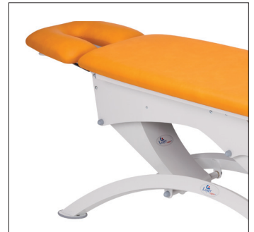
Capre M2, rectangular frame tubing

Explanation of markings: • =standard feature option =optional accessory - =not available