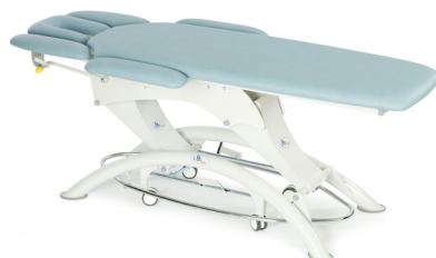
Capre M4 River, Oval shaped frame tubing, place-free, castor set, side supports