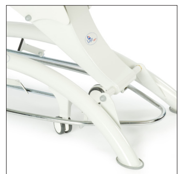
Central locking castors and place-free adjustment ring