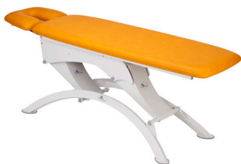
Capre M2 Mango, rectangular frame tubing